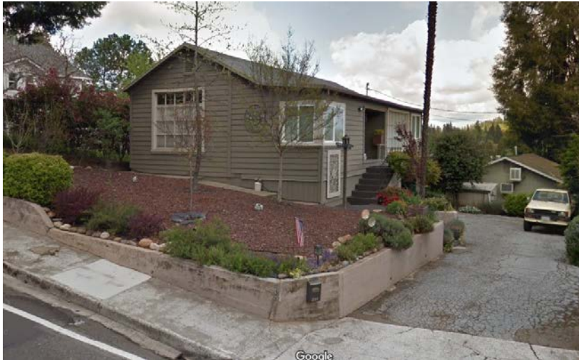
Figure 2. 3148 Sacramento St