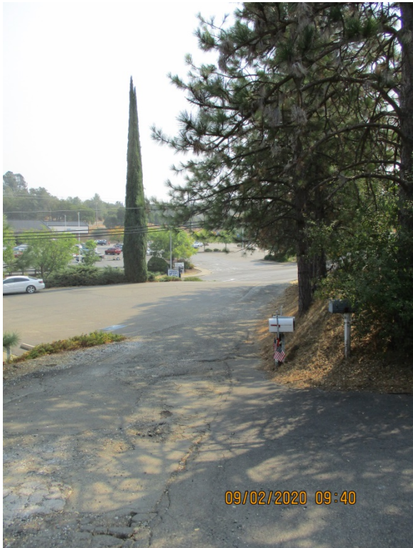
Figure 6 Sunset Knoll, looking east toward Placerville Drive.