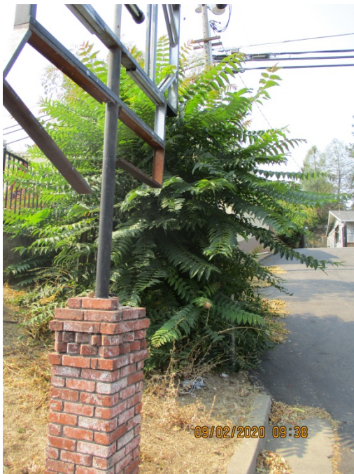
Figure 6 Pole sign at driveway entrance.