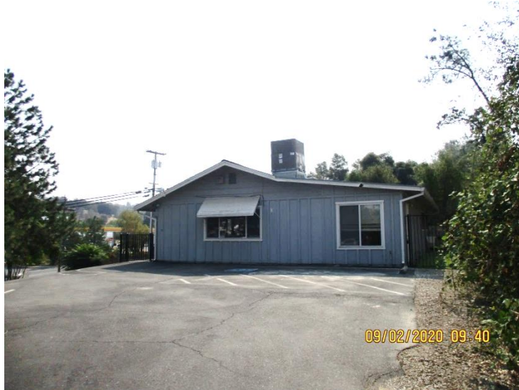
Figure 4 North building elevation.