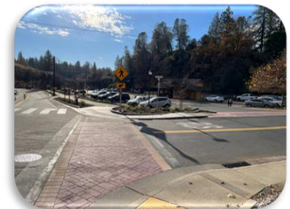
The intersection at Mosquito Rd. and Clay St.

*Projects partially funded by grants or other revenue sources.